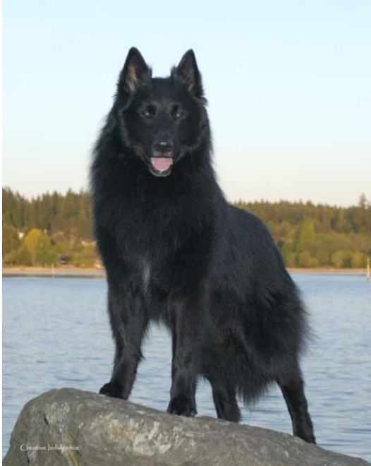
BLACKSTAR'S APOCRYPHAL TALE, CD, TD, NA, NAI, RE, VCD-1, CGC,TT, FMD